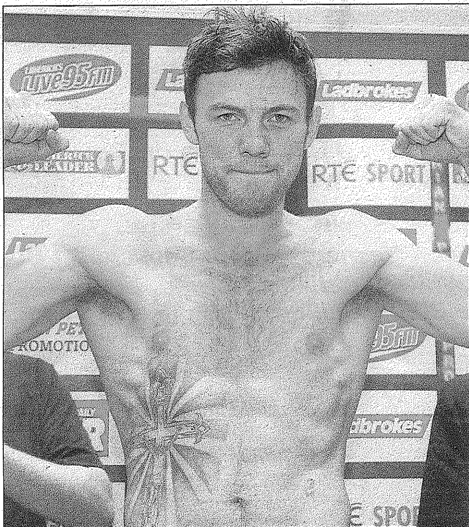
Andy Lee wants a crack at champion Kelly Pavlik.